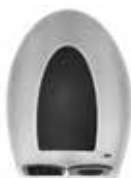
S-MODEL Brushed Satin