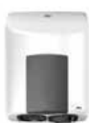
R-MODEL Gloss White