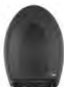
S-MODEL Matt Black