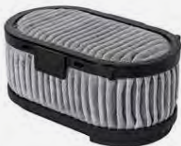
Air Management Filter

The patented AMF filters air coming into the Hand Dryer removing airborne pathogens, bacteria, mould, pollens and dust particles from the surrounding environment to provide clean air for drying hands.