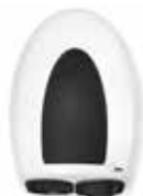
S-MODEL Gloss White

S-Model Base: 325mm x 250mm Projection: 185mm Height x Width: 340mm x 235mm R-Model Base: 330mm x 235mm Projection: 185mm Height x Width: 330mm x 235mm