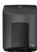
R-MODEL Matt Black