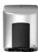
R-MODEL Brushed Satin